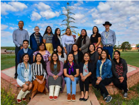
2019 SREP Students, Faculty & Staff

At the conclusion of the program, the students and staff will work on analysis of data and presentation of their experiences in public health and health research virtually.