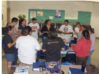
"I'm very thankful to be given this opportunity. Public Health research is a new topic for me. I love it and want to do more." Participant 2007